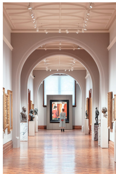
National Portrait Gallery