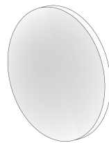
Diffuser lens used for softening and widening beams