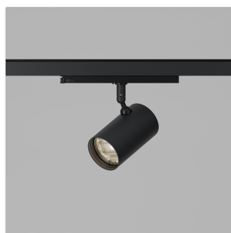
ZTA.70.Mains Track.Wall Wash