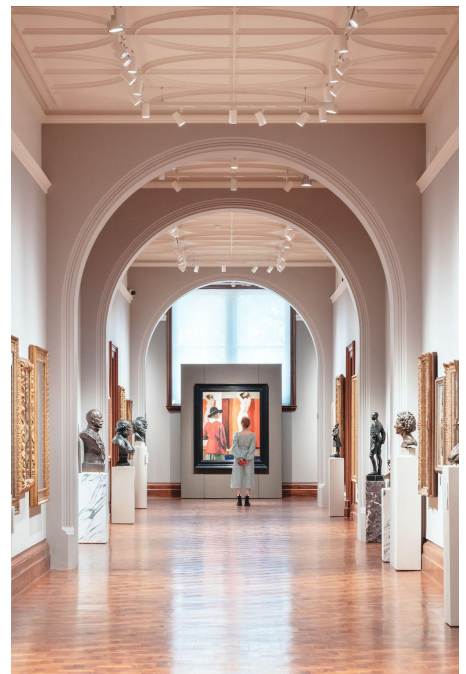
National Portrait Gallery