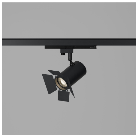
Removable barn doors used to crop beams