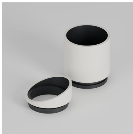
Removable straight cut or slash cut snoot.