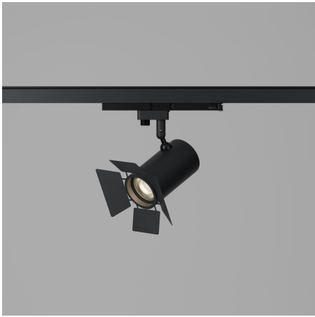
Removable barn doors used to crop beams