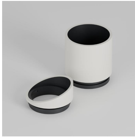
Removable straight cut or slash cut snoot.