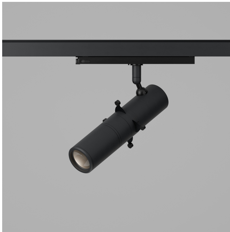
ZTA.50 Mains Track Framer – Adjustable Beam