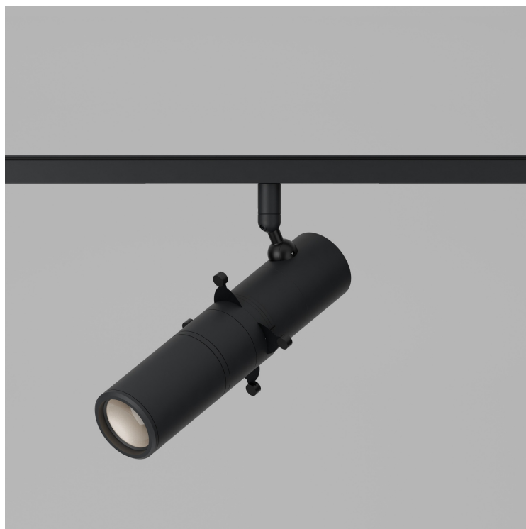
ZTA.50.LV.TRACK FRAMER - ADJUSTABLE BEAM